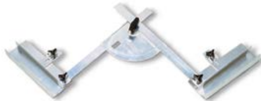
Convenient Bend-Guide™ is included with every BHB-520D.